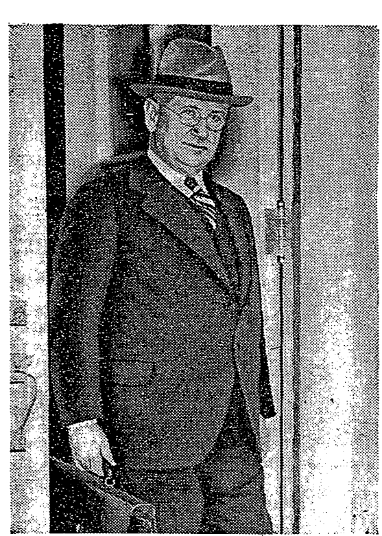
Secretary of the Interior Ickes.