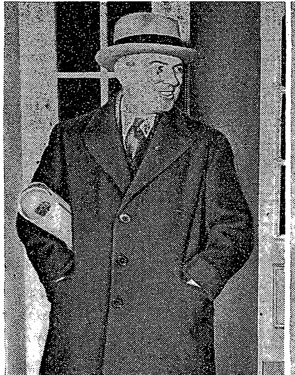
Under-Secretary of Agriculture Tugwell.